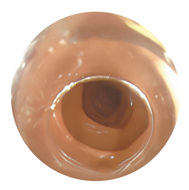
Wide inner diameter Good visibility can be ensured and a therapeutic device can be inserted smoothly.